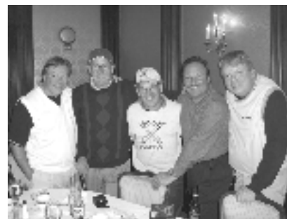
The united team of Brooklyn Prep 1970 alumni and Nazareth 1970 alumni seemed to have a lot of fun—even if they did get lost!